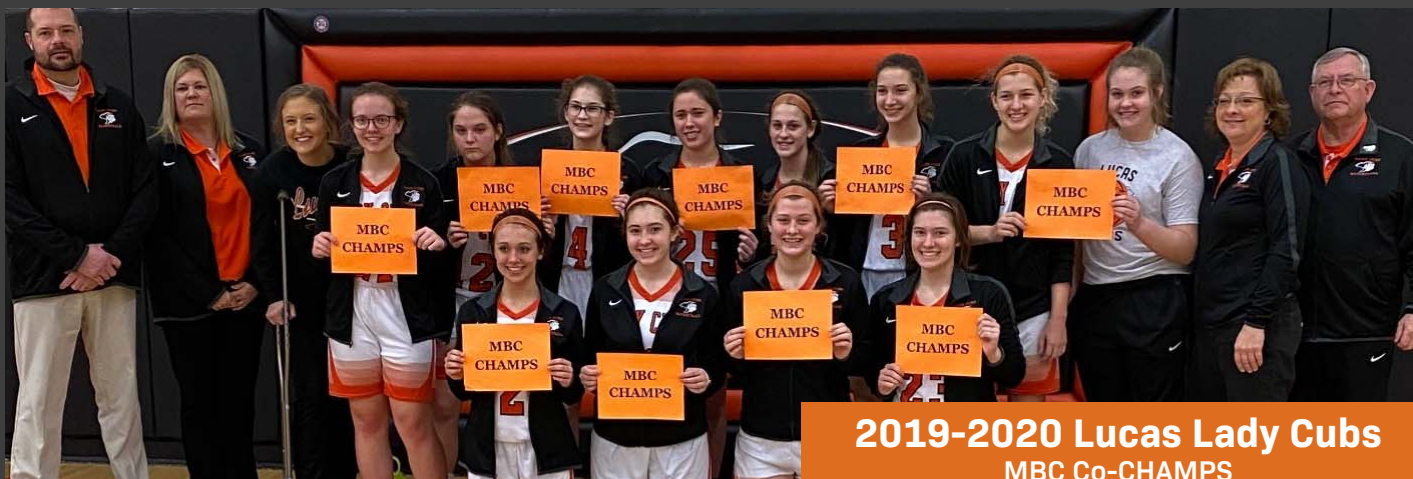
2019-2020 Lucas Lady Cubs MBC Co-CHAMPS