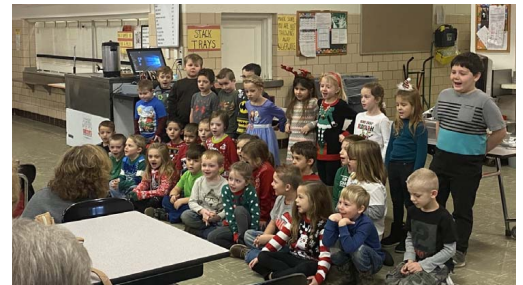
Lucas Kindergartners singing to the Senior Citizens, December, 2019.