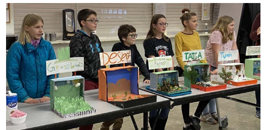
Fifth Grade Science Biomes Projects, January, 2020.

Child care will be provided in the kindergarten classrooms during the Parent Meeting on April 20th.