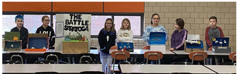
Fourth Grade Social Studies Revolutionary War Projects, January 2020.