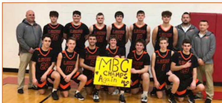
2019-2020 Lucas Cubs MBC CHAMPS

The boys earned the #1 seed in the Division 4 sectional tournament where they will open tournament play on Tuesday 2/25/20 at Shelby High School where they will host Mansfield Christian (#13) at 7pm.