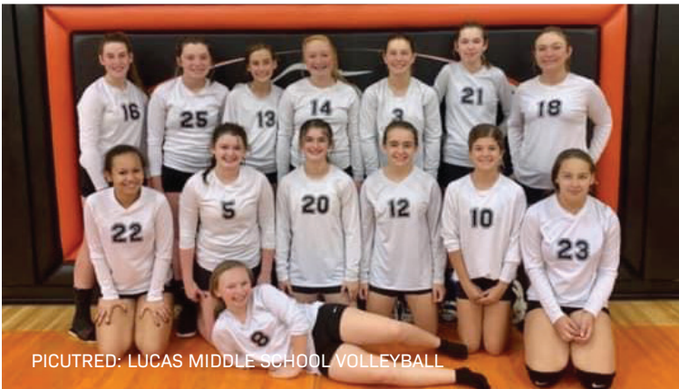
PICTURED: LUCAS MIDDLE SCHOOL VOLLEYBALL