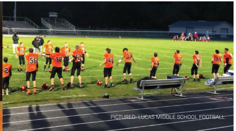
PICTURED: LUCAS MIDDLE SCHOOL FOOTBALL