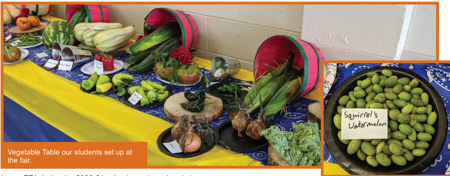
Vegetable Table our students set up at the fair.

Lucas FFA during the 2020-21 school year has already been working hard on projects and activities. In addition to working hard we are excited this year to be extending our programming into the 8th grade and have over 55 members enrolled in our program.